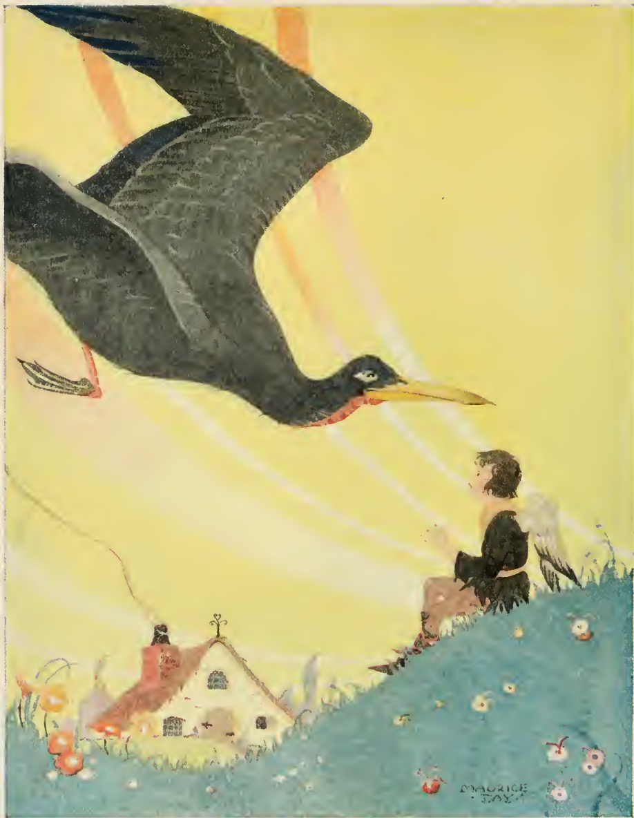
Every year, on the Bird-Boy's birthday, a great gray bird was seen.